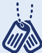
AID FOR VETERANS